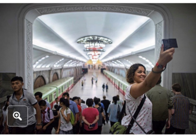
A tourist taking a selfie during a visit to a subway station in Pyongyang, North Korea, this month.

Interviews with The Real News & DemocracyNow!