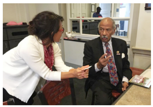
Christine Ahn speaks with U.S. Congressman & Korean War veteran John Conyers (D-MI)

The conference afforded exchanges among policy analysts, government officials, academics and practitioners across the foreign policy spectrum. Following the conference, KPN members discussed the need for greater engagement with the DPRK with Members of Congress and their staffers, including Representative John Conyers (D-MI), one of the two remaining veterans of the Korean War in Congress.