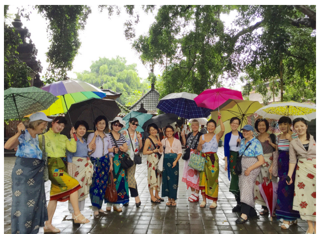
WCDMZ and North Korean delegations on a community-building outing

We creatively regrouped, organizing two back-to-back gatherings with each Korean delegation. Eight WCDMZ members met with six North Korean and four South Korean women in Bali, Indonesia, a neutral third-party country with diplomatic relations to both Koreas. These meetings facilitated our developing shared and particular understandings and contributed to shaping our next steps.